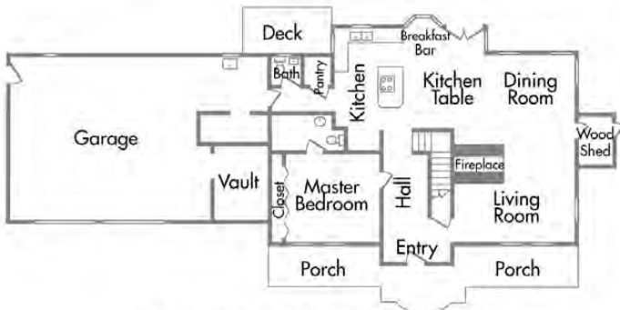
1ST FLOOR (AFTER)