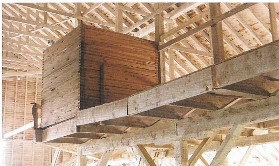
An old barn was incorporated into the design of the Saffron Fields tasting room in the Willamette Valley.

At Saffron Fields, Shugar found several ways to take visitors outdoors, both physically and visually. The tasting room, with glass on two sides, leads to an attrac-