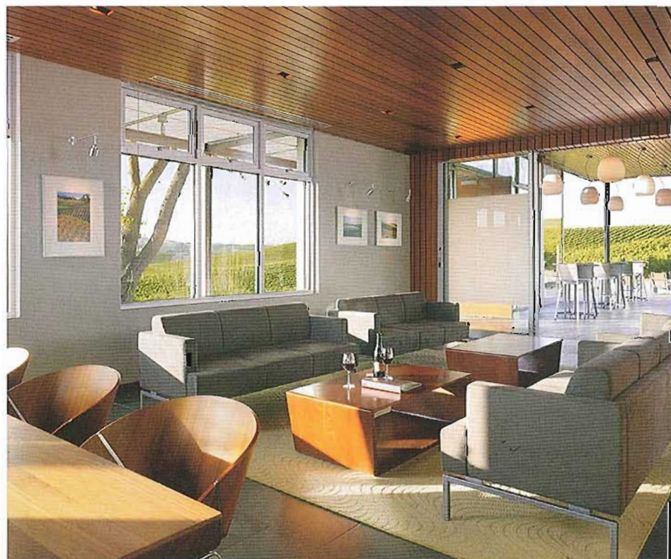
Cuvaion Estate Wines features a stylish private room for VIP tastings.

Incorporating special spaces for wine club and VIP members is important to enhance their experience and make them want to return. "The best way to provide that is through privacy," Thornley said. But as a practical measure, he situates private rooms next to