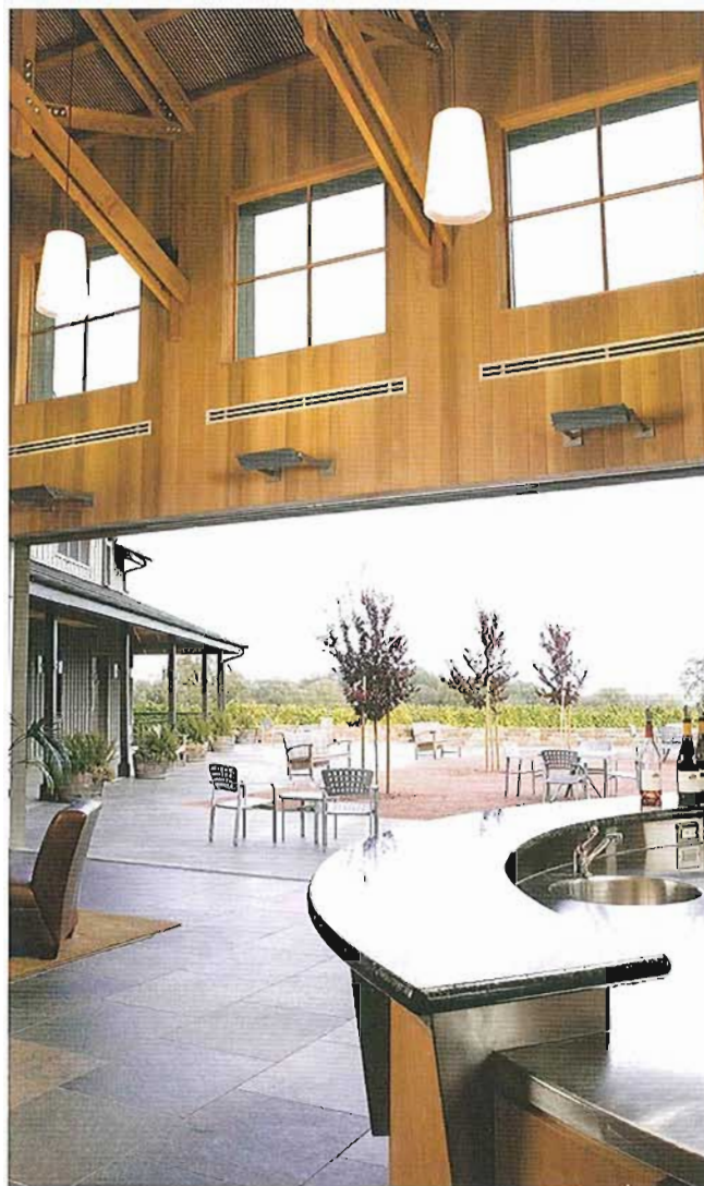
The tasting room at Lynmar Estate was designed to open out into an outdoor courtyard.

Thornley also provides outdoor views and access for tasting room visitors. "In all our winery projects, we try to allow the tasting rooms to open up to an outdoor area," he said. "At Lynmar Estate (in Sebastopol, Calif.), we had 10-foot by 6-foot glass panels that slid into a pocket in the wall and essentially disappeared, opening up the tasting room to the courtyard. At Cuvaion, we took the sliding glass panels away so that space actu-